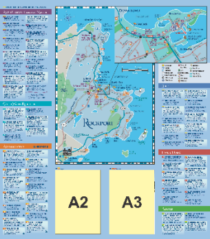
All size dimensions are width x height