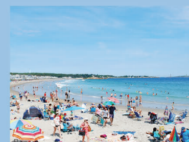
Long Beach

Explore sandy beaches for swimming, diving, sailing and kayaking. Visit scenic Halibut Point State Park's new visitor center and Millbrook Meadow's lovingly restored gardens, ponds and playground. Traverse public footpaths along the sea or throughout historic Dogtown. Trek to granite quarries. Discover the lighthouses of Straitsmouth and Thacher Islands. Watch the most magical sunrises and sunsets.