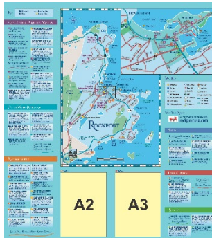
All size dimensions are width x height

B1 – B8: Standard Horizontal (3.375 x 1.75 in.)