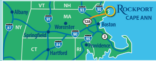
39 D-Map (See Downtown Map Inside)

GREATER CAPE ANN CHAMBER OF COMMERCE ROCKPORT DIVISION