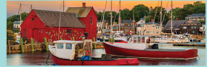
Rockport Harbor & Motif No.1 (Fishing Shack)

Only an hour north of Boston by car or train, and at the heart of the Essex Coastal Scenic Byway, Rockport is the perfect destination for relaxation and inspiration. Full of intriguing history, unmatched beauty and serenity, Rockport invites you to slow down and be renewed.