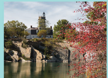
Halibut Point State Park

Explore sandy beaches to swim, snorkel, kayak, paddleboard and dive. Visit scenic Halibut Point State Park's Visitor Center and Millbrook Meadow's lovingly restored gardens, ponds and playground. Traverse public footpaths along the sea or throughout historic Dogtown. Trek to granite quarries. Discover the lighthouses of Straitsmouth and Thacher Islands. Watch the most magical sunrises and sunsets.